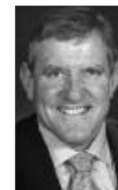
FOREWORD TO THE PAPER:

Worst of all it's a technology with no long-term working models from which to assess its feasibility or safety. It's a