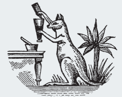
GO ON SKIP — FIND THAT VACCINE, YOU CAN DO IT.